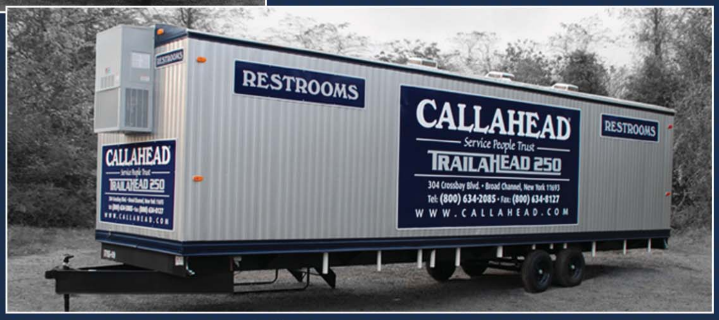
See reverse side for design features & specifications

Service People Trust 304 CROSSBAY BLVD. BROAD CHANNEL, NY 11693 TEL: (800) 634 - 2085 FAX: (800) 634 - 8127 W W W . C A L L A H E A D . C O M