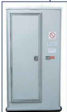
Example of Single Unit