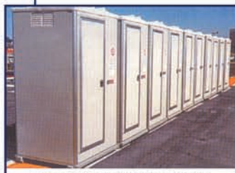
Example of Multiple Units