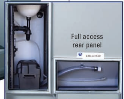
Full access rear panel