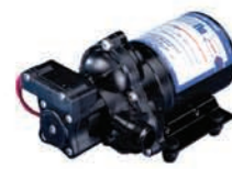
Shurflo Marine Water Pump