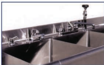
Closeup of Fixtures