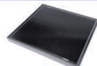
Siemens ST-10 Solar Panel