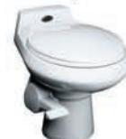
Sealand 510 China Toilet