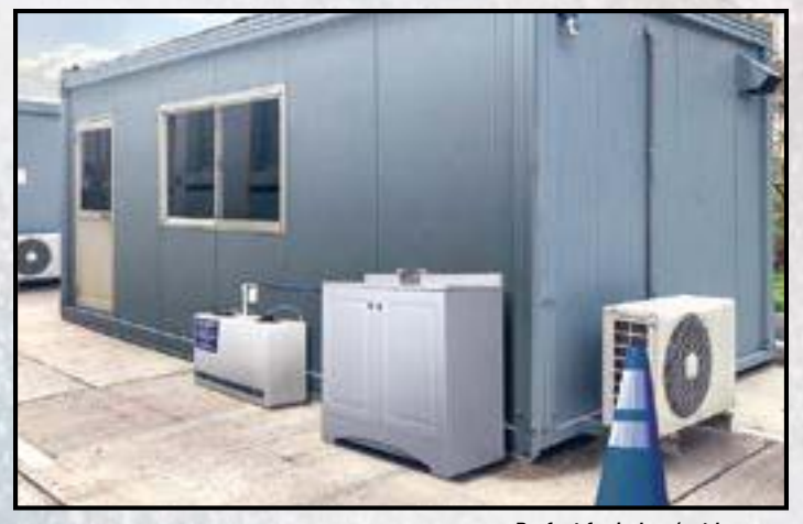
Perfect for indoor/outdoor use.

at entirely different locations on the job site and does not require gravity to operate. Container officer trailers could now have an operating sink and faucet in just about any remote area. Locations include construction sites, parks, marinas, bridges and tunnels, wooded areas, beaches, industrial plants, and countless more, Charles W. Howard invented the MAC SINK SYSTEM for CALLAHEAD to solve the problem of moving grey sink water to a waste tank which before the MAC SINK SYSTEM was invented was impossible. With the MAC SINK SYSTEM the sink and waste tank can be totally remote from each other and operate as if the grey water waste tank was located directly beneath the sink drain. Our groundbreaking system allows the grey water waste tank to be well above the sink, on a higher floor, up to 150-feet away and placed vertically or horizontally away from the sink.