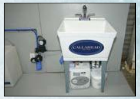
Also may be used with utility sink/laundry tub.

"Products Push Out, Services Spring Back."