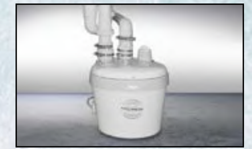
Powerful macerator pulverizes and ejects wastewater.