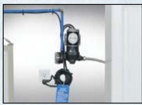
On demand pump provides consistent water pressure.