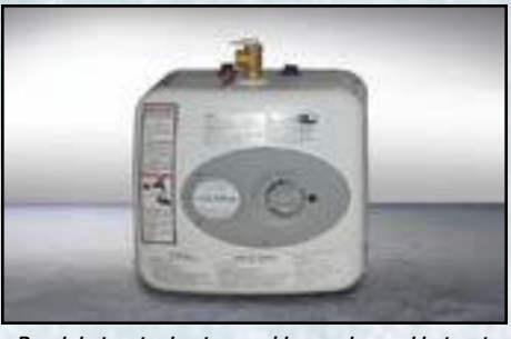
Bosch hot water heater provides on demand hot water.