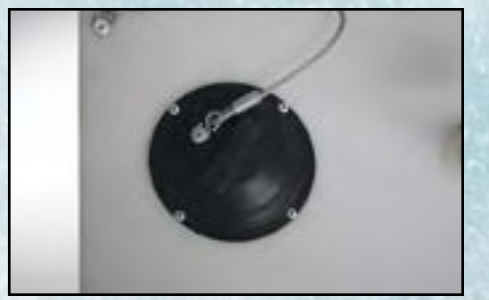
Large access ports enable fast refilling of fresh water.

The MAC SINK SYSTEM's 50-gallon grey water holding tank is black and a durable 1/4 inch thick polyethylene material. The grey water waste tank is set up outside at a location you select. The grey water tank can be professionally installed, even yards away from the office or container trailer. Our 50-gallon grey water holding tank can be placed above, below or across without any need for gravity. CALLAHEAD designed our grey water holding tanks with two 3-inch threaded female flange connections with caps. There are also three 10-inch black equipment covers to allow for installing equipment inside the grey water holding tanks. Equipment inside the grey water tanks includes heaters, pumps, water shutoff valves, high water alarms, etc. These equipment covers create the bin effect, opening all the covers to scrub and clean out the grey water. The equipment covers and caps provide easy access for service technicians to supply our hospital-grade sanitary cleaning inside the grey water holding tank at each All tanks are equipped with gallonage service. signs with CALLAHEAD contact information for convenience. All caps and covers on the grey water holding tank include plastic-coated cables connected to the tank so they will never get lost.