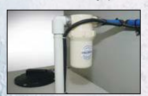
Strainer/filter's water before reaching the faucet.

Every single detail of the MAC SINK SYSTEM has been perfected. The trap and discharge pipe is another component of CALLAHEAD's MAC SINK SYSTEM . The trap heads up to the porcelain sink, then hooks up directly to the macerator pump. The trap stops the air from coming back up the sink drain. When the grey waste water rises in the macerator tank, it automatically turns on and pumps the grey water to the waste tank