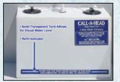
Fresh water tank allows for visual cue of water level.